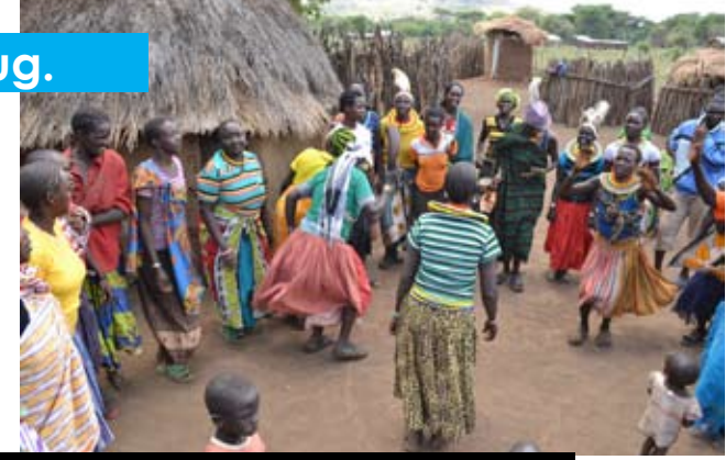
FGM Awareness program for Karamoja