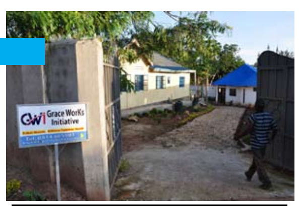
GWI Offices - Kampala