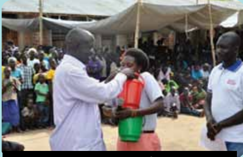
Hon. Musa Ecweru, Minister of State, Disaster Preparedness receiving Menstrual Kits from GWI CEO for S.Sudan refugees