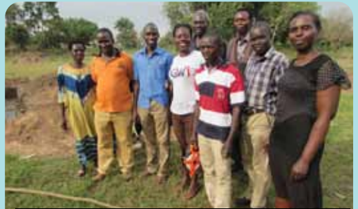
Kibuku District, Engineer, Env. Officer, Physical Planner and the Health Inspector during their visit at Bukomolo clinic site