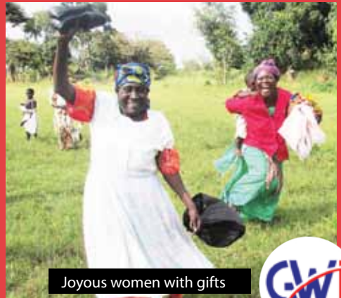
Joyous women with gifts

Through GWI, Coca Cola donated many lovely gifts including clothes, shoes, blanket, and suitcase. During distribution, all seven villages gathered at the clinic site where they seemed to have a lovely time. Thank you Coca-Cola!