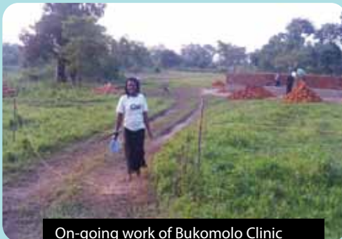
On-going work of Bukomolo Clinic