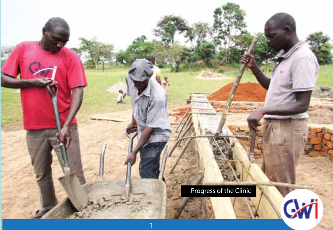
Progress of the Clinic

The clinic will ensure that people have access to treatment and other health care benefits like those of malaria control, immunization, nutrition and food security, HIV/AIDS, water and sanitation among others. The aim is to drive down infant and maternal mortality and make primary healthcare services available to underprivileged rural inhabitants in Uganda.