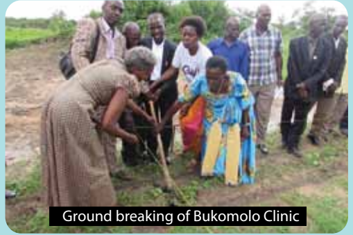
Ground breaking of Bukomolo Clinic